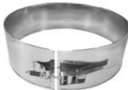
Latch & trunion